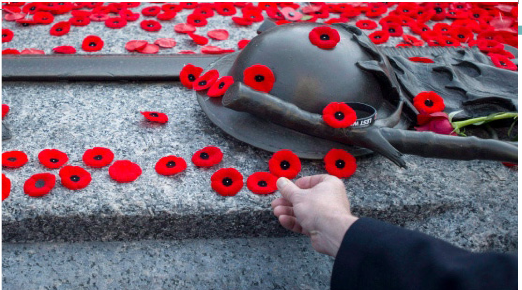
Poppies at the National War Memorial in Ottawa, 2014