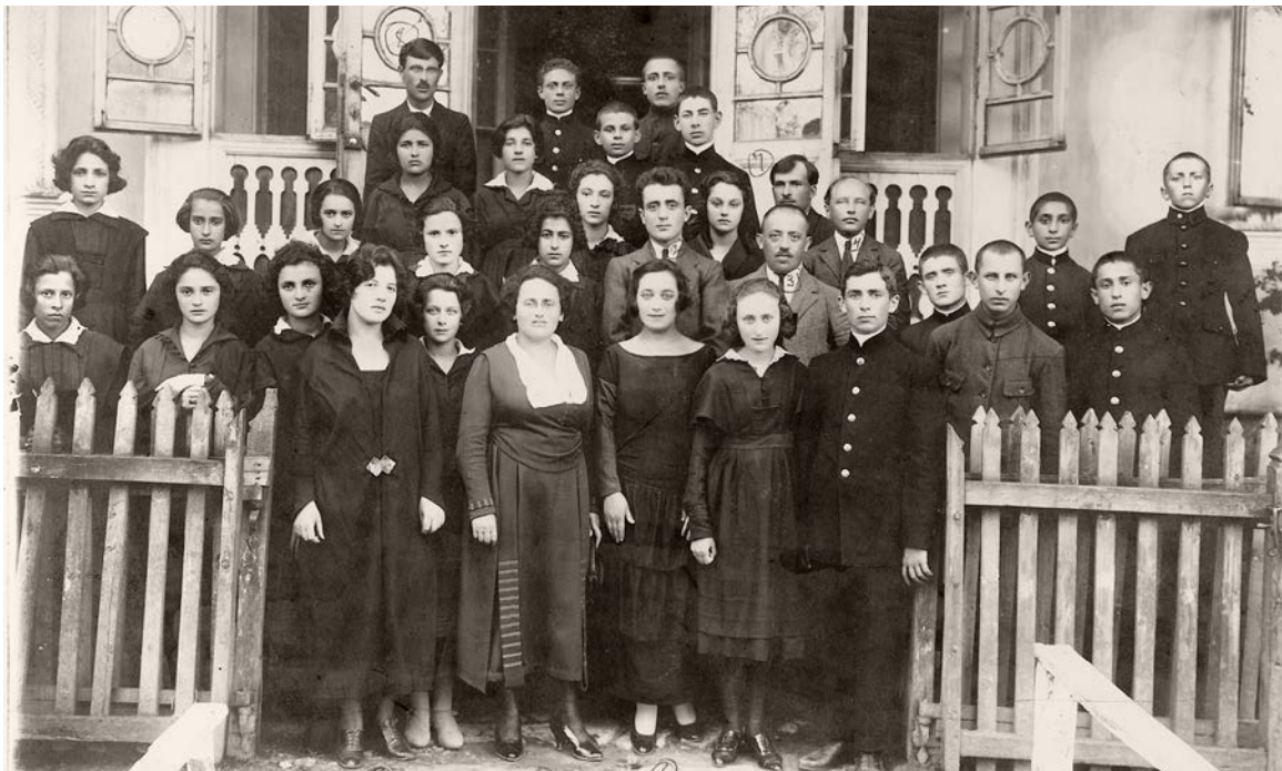
Graduating class of the Lipcani Jewish high school, Moldova, 1926