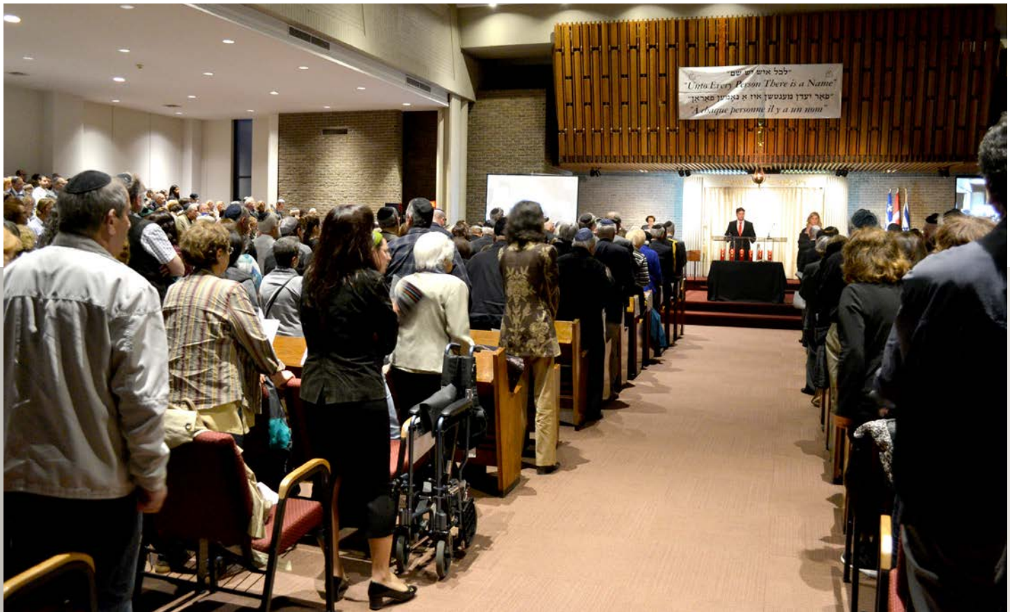
Yom Hashoah Commemoration, 2016

The commemoration guide was created to accompany the travelling exhibit entitled “ And in 1948, I came to Canada ” – The Holocaust in Six Dates to help the organisations hosting the exhibit with the organization of commemorations related to the theme. Four types of commemorations are included in this guide, with descriptions, suggested themes, readings and links to useful websites.