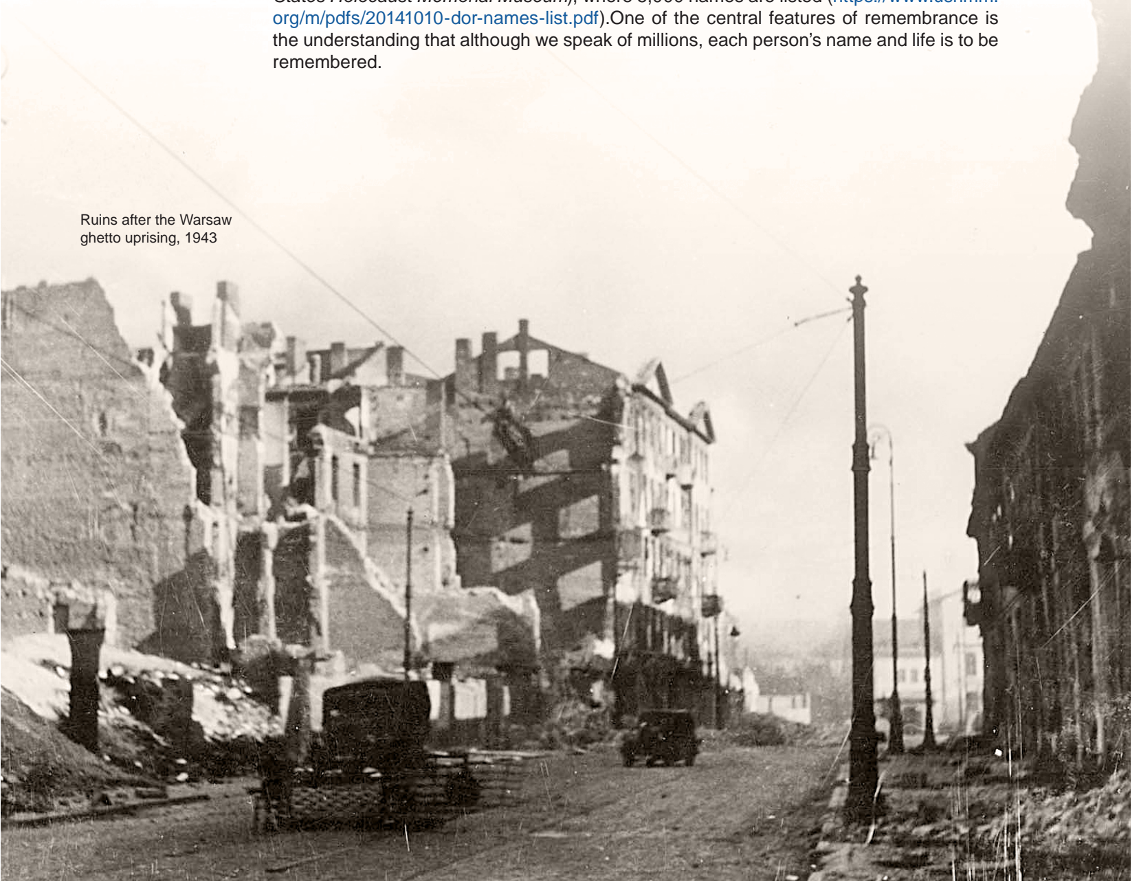
Ruins after the Warsaw ghetto uprising, 1943

Please visit Yad Vashem's Central Database of Shoah Victims' Names where you can find 4.5 million names of Jews murdered in the Holocaust ( http://yvng.yadvashem.org/ ). You can also consult the Names List of Victims of the Holocaust on the USHMM's website ( United States Holocaust Memorial Museum ), where 5,000 names are listed ( https://www.ushmm.org/m/pdfs/20141010-dor-names-list.pdf ). One of the central features of remembrance is the understanding that although we speak of millions, each person's name and life is to be remembered.