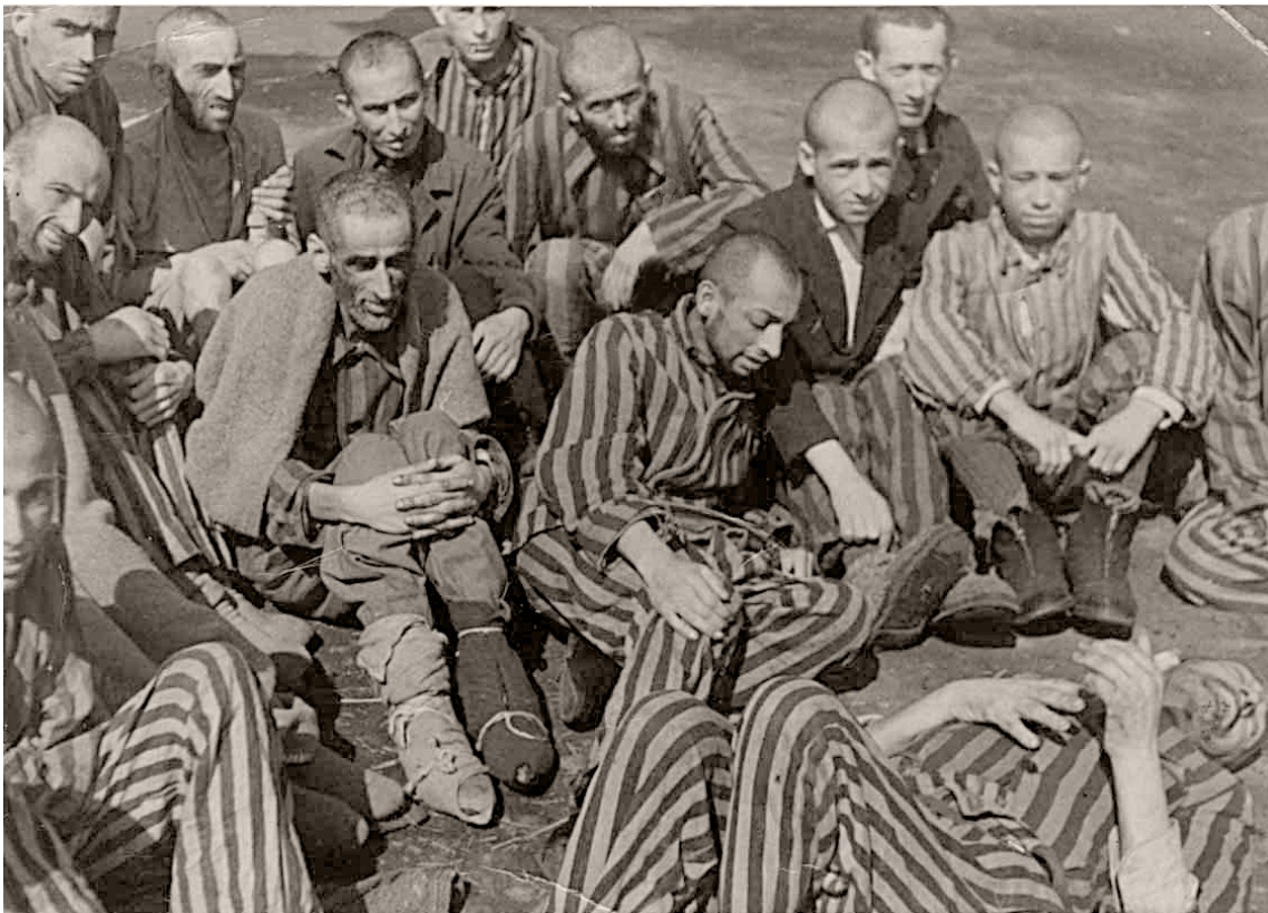
Group of newly liberated prisoners of the Theresienstadt camp, Czech Republic, 1945