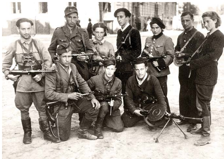
Jewish partisans returning to Vilnius, Lithuania, after it was liberated in July 1944

http://www.holocaustresearchproject.org/revolt/sonderevolt.html .