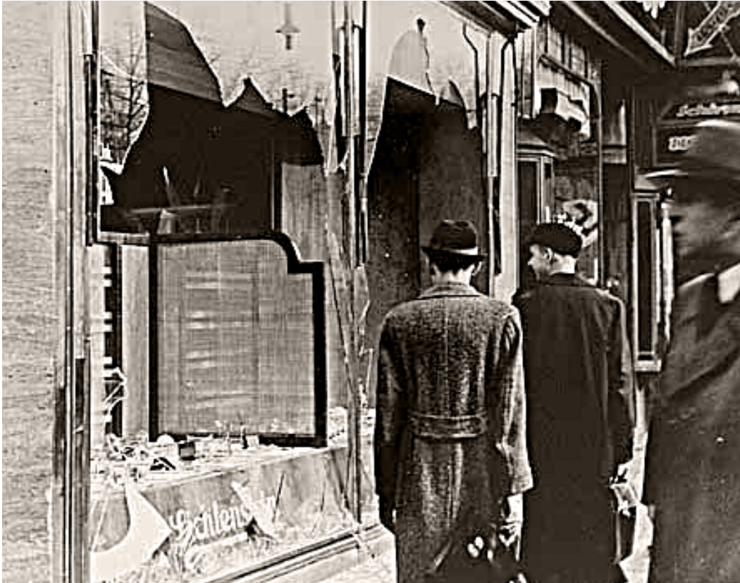
Broken windows after Kristallnacht, 1938