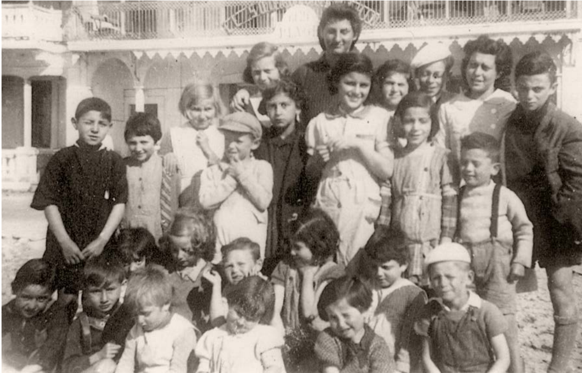
Group of children at the OSE [Children's Aid Society] home in Palavas-les-Flots, France, 1942

Approximately 1.5 million children were murdered during the Holocaust. The discrimination against and exclusion of Jewish children increased in the 1930s with the Nazis rising to power. With the invasion of Poland and the start of World War II, their situation became increasingly precarious: they were forced into ghettos with their families, many starved and fell prey to disease, and many witnessed violence against or the murder of their parents. They too were subject to violence and murder.