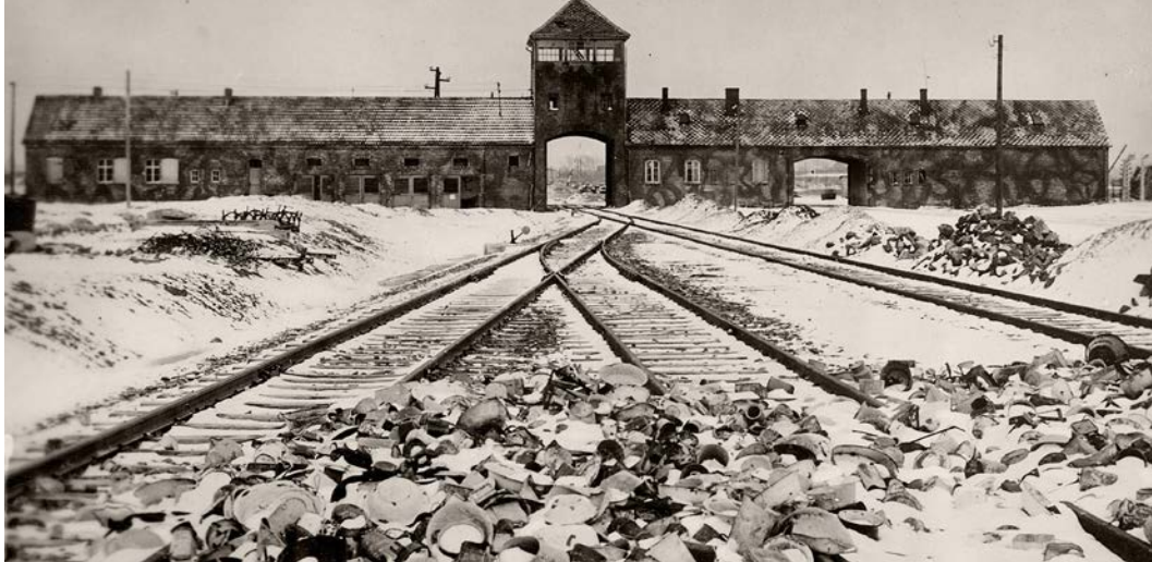
The gates of the Birkenau camp, Poland, 1945

Between 1938 at 1945, the Nazis murdered 6 million Jews and tried to systematically destroy all the Jewish communities of Europe. Jews were herded into ghettos, where thousands died of starvation or illnesses. They were crowded into cattle cars and deported to concentration camps, where many were killed immediately.