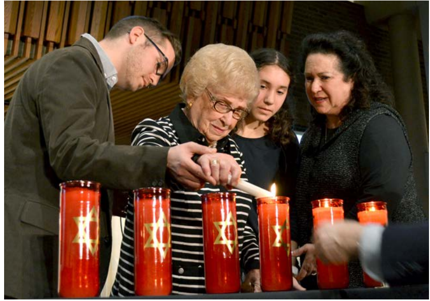
Left: Prisoners in Auschwitz at liberation in 1945