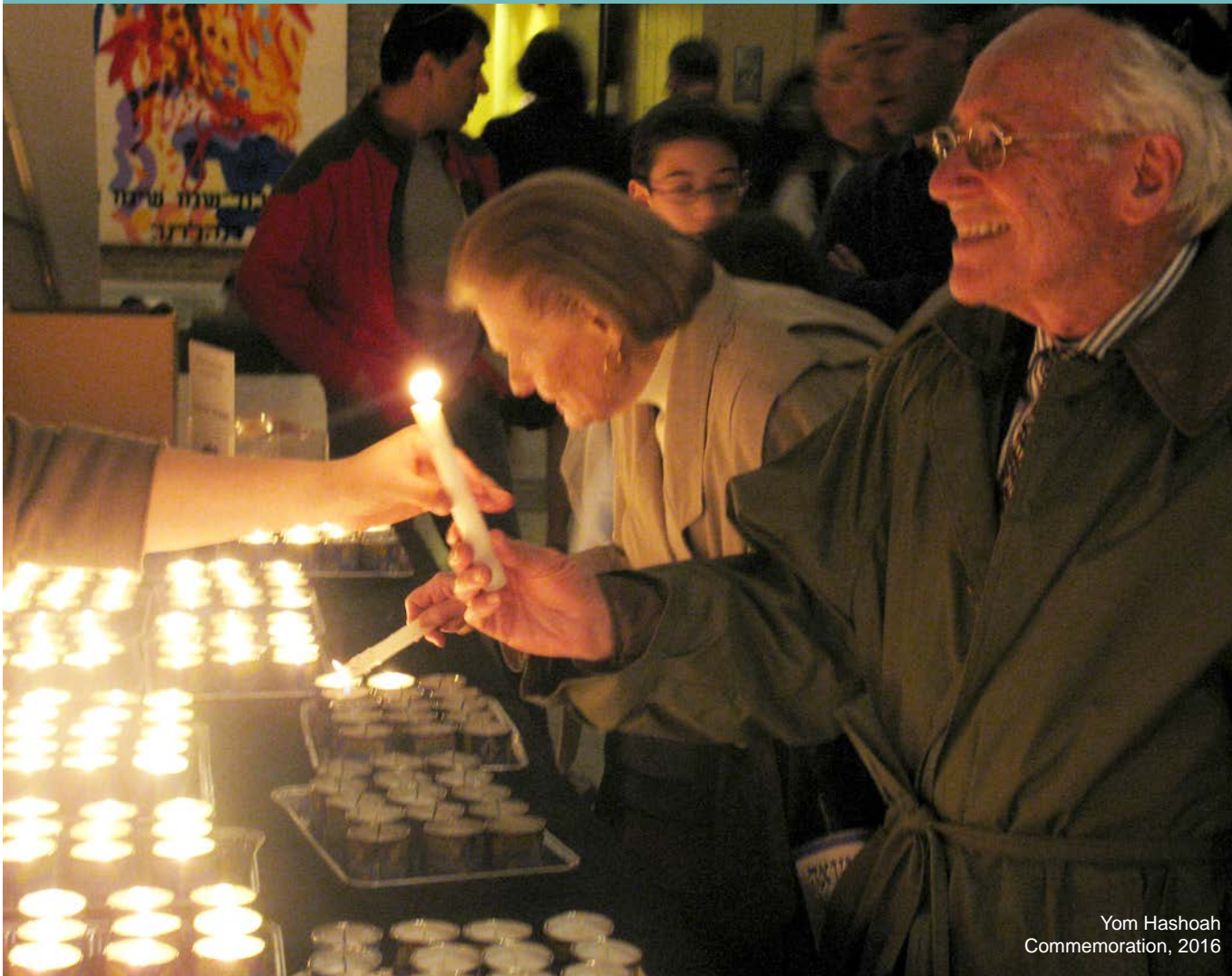
Yom Hashoah Commemoration, 2016