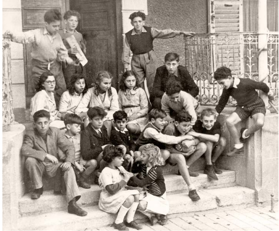
Group of children in front of the OSE [Children's Aid Society] home in Le Raincy, France, 1945

Some tried nonetheless to continue their lives in these countries. A number of survivors managed to immigrate to Palestine, but most ended up as refugees in displaced person camps, waiting for a country to accept them. Despite the loss of their families, homes and communities, many survivors found the strength and resolve to rebuild their lives and put down new roots, particularly outside of Europe. They managed to build families and contribute to communities around the world in many fields of human endeavor.