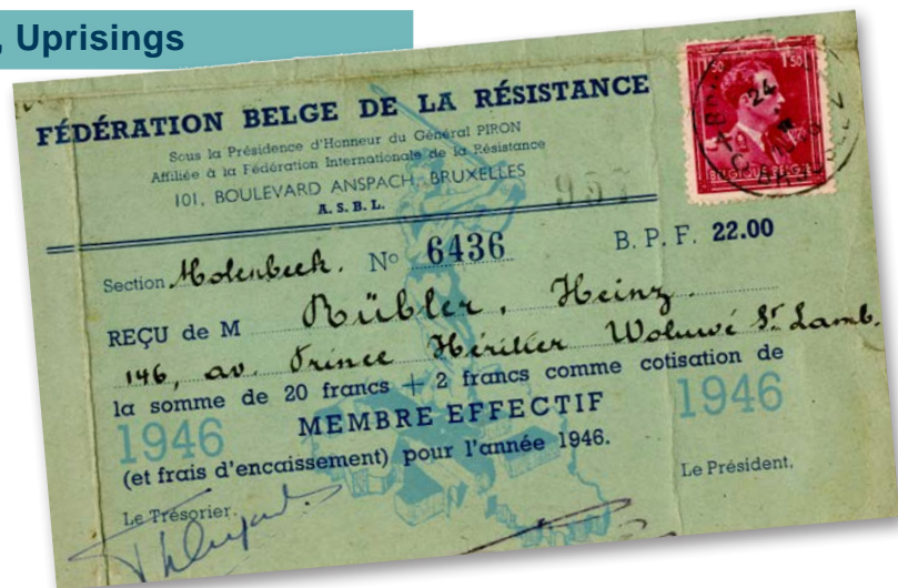
Membership card for the Fédération belge de la Résistance , 1946

Most resistance during the Holocaust was unarmed. Jews tried to retain their humanity, dignity, and sense of civilization in the face of the Nazis' attempts to dehumanize and degrade them. In many ghettos, underground schools, cultural activities and religious services were organized. Young people were often active in the underground resistance, producing newspapers and radio programs and preparing acts of sabotage.