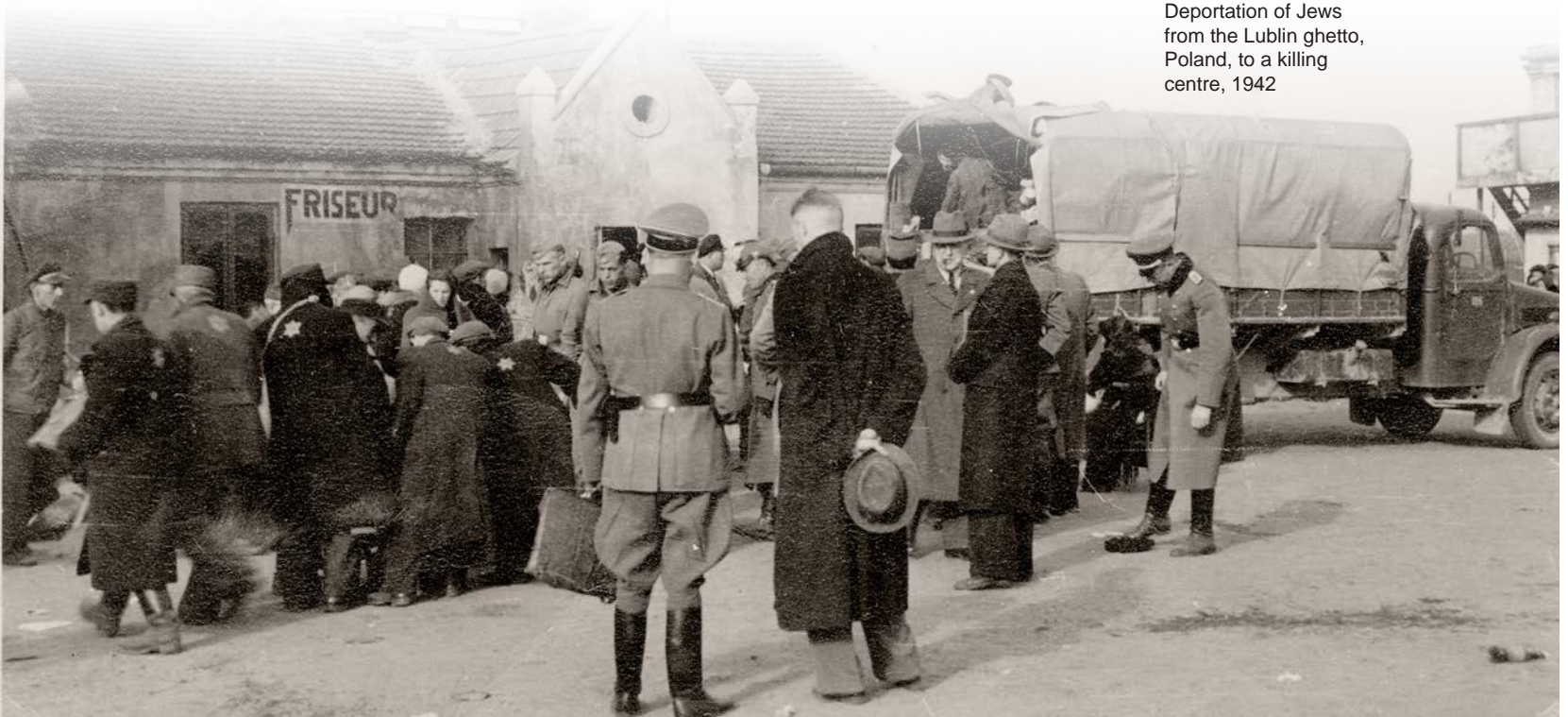
Deportation of Jews from the Lublin ghetto, Poland, to a killing centre, 1942

Others died through slave labor, starvation and brutal treatment. Mobile death squads called Einsatzgruppen slaughtered nearly one million Jews, at mass murder sites, in the occupied parts of the Soviet Union. The retreating Germany army forced thousands of camp inmates on death marches without food or drink, and killed all who could not keep up or collapsed.