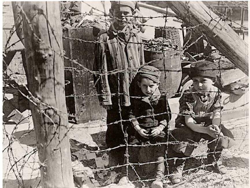
Children in the Buchenwald concentration camp in Germany at the end of the war

http://www.virtualmuseum.ca/sgc-cms/expositions-exhibitions/orphelins-orphans/english/